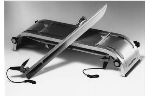
Item 7139 Aluminium Sharpening Jig – Low

This is suitable for all speed blades with leather boots.