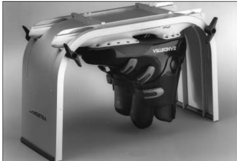
Item 7130 Aluminium Sharpening Jig – High

These aluminium sharpening jigs are made out of one piece of special extruded profile. The jigs are stable. The precision spacers have a so-called _ fast locking system. The jigs are natural anodized.