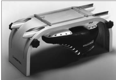
Item 7135 Aluminium Sharpening Jig – Standard

This jig is 10 cm higher than a standard jig. Also suitable for short track skates.