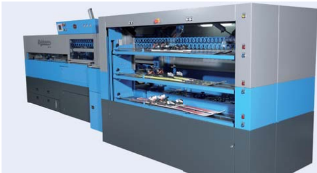
Optional with dis-/charging magazine for more efficient operation