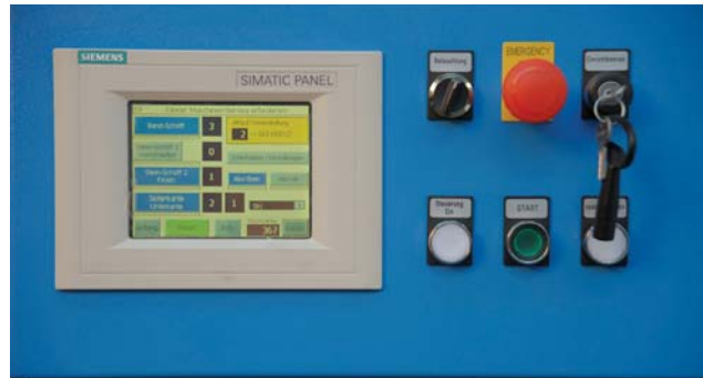
Touch screen monitor - modern and easy to operate