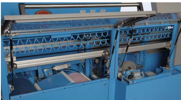
Precise belt and stone grind for perfect base in one step