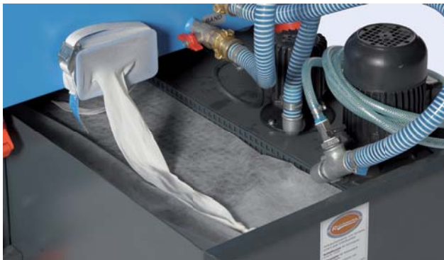
Fast and easy change of filter