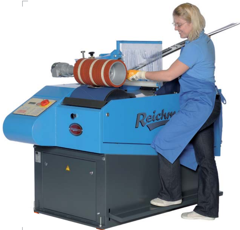
Comfortable change from stone to belt due to pneumatic lifting device