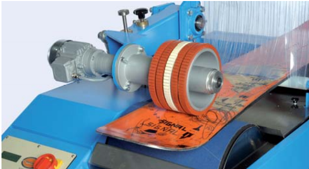
Perfect structures for ski and snowboard